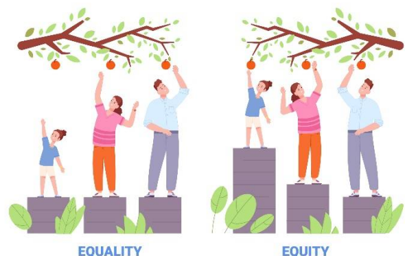
Image of the difference between Equality and Equity

While promoting I&D, regarding employees as human capital, building their career paths, and increasing their engagement, we acknowledge that rather than simply providing equal opportunities (Equality), we need to get close to each individual and find the optimal opportunities (Equity) considering each one's environment and situation. Based on the belief that this will eventually increase enterprise value and lead to the creation of a sustainable organization, we formulated the DEI Policy that develops and evolves Equality into Equity.