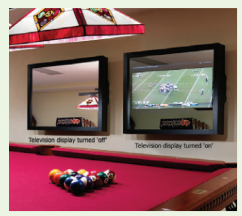
MirroView<sup>™</sup> looks like a normal mirror when the screen is 'off'(left). When the screen is 'on,' the image shows through the mirror for a clear view of the screen beneath (right).

As this product allows highest transparency for true color representation, it is used for glass display cabinets showing the color of products inside as it is, and for buildings whose design is of paramount importance.