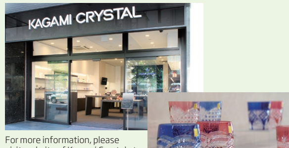
For more information, please visit website of Kagami Crystal at http://www.kagami.jp

In May 2014, Kagami Crystal's Ginza store was relocated and renewed. The new store is located in Ginza 6-chome, a famous shopping area in Tokyo. We look forward to your next visit to our new Ginza store.