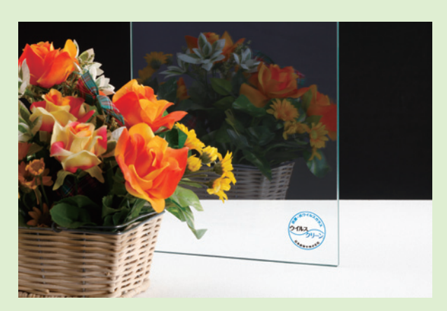
VirusClean® preserves the transparency of the glass.

NSG Group aims to be the global leader in high performance glass and glazing solutions that contribute not only to energy conservation and generation but also a secure and safe society.