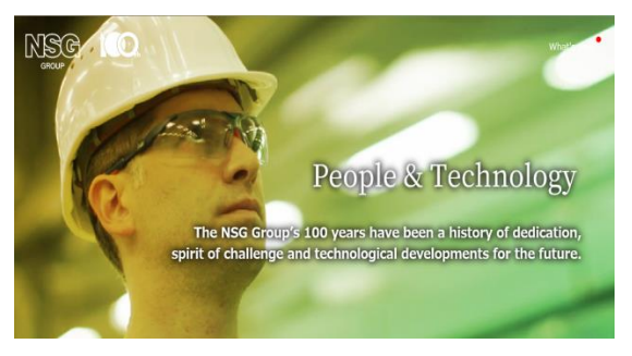
Top pages of "100 Years of History" and "People & Technology" URL: http://100th.nsg.com